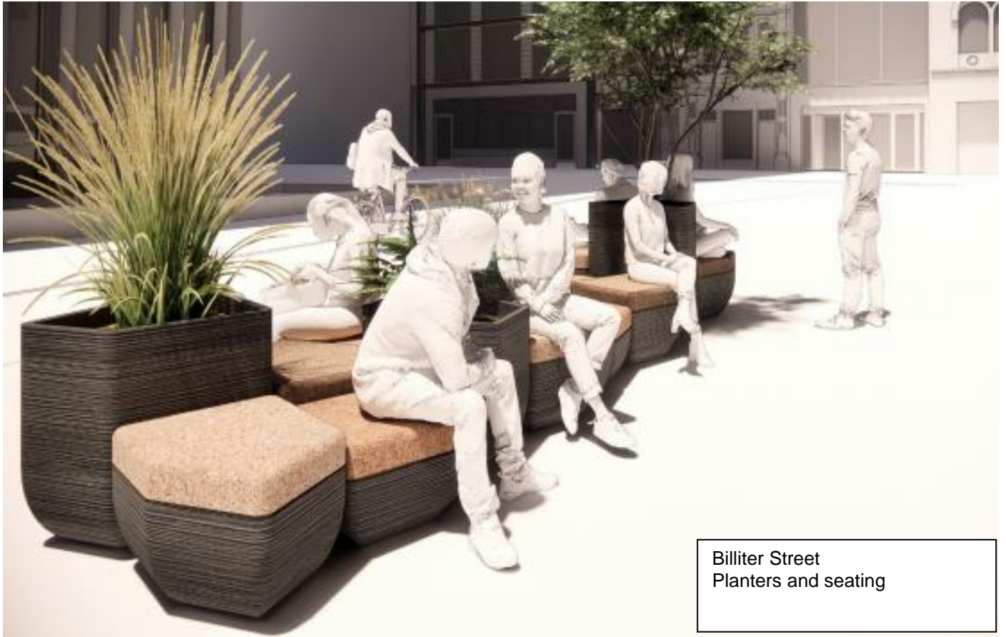
Billiter Street Planters and seating